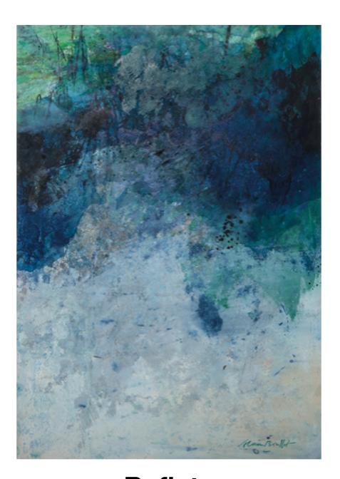
Reflets Oil on paper mounted on canvas 100 x 70 cm