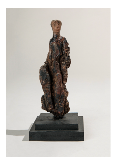
Sans titre Terracotta and wood 22 x 10 x 10cm