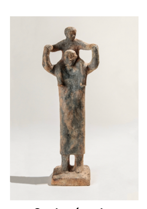
Sur les épaules Terracotta 38 x 13 x 9,5 cm